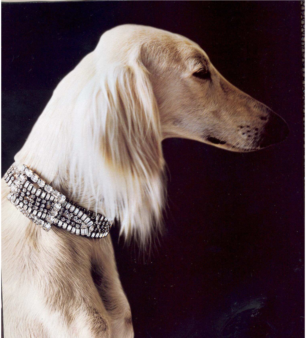
FC Country Laine's EZ Goin', LCM